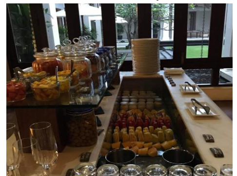
Chi Restaurant Decadent Daily Breakfast

A six course closing dinner, discovering the magnificent flavours available in the Kingdom of Wonder.