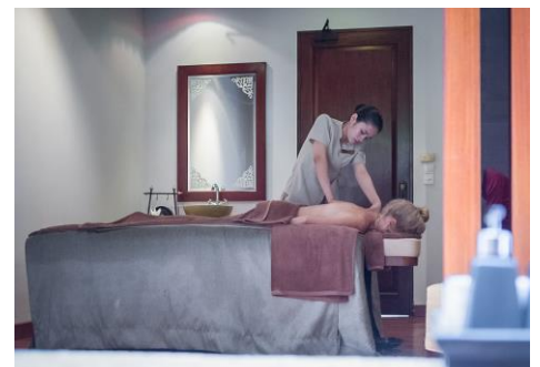
Anantara Spa Complimentary 30 minute Massage